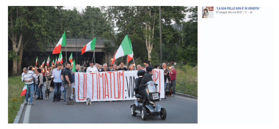
Wheelchair's plate: BENITO

We can't omit that this animal rights' "journalistic web page" supported and spread the racist demonstration in favour of Enpa's kennel in Turin, whose main effect has been to fan the flames of hate against Romani people, by the hands of Movimento Tricolore Torino, social-nationalist identitarians and Turin's Fuan (nostalgic university students who keep MSI's young movement's name, now within Fratelli d'Italia)